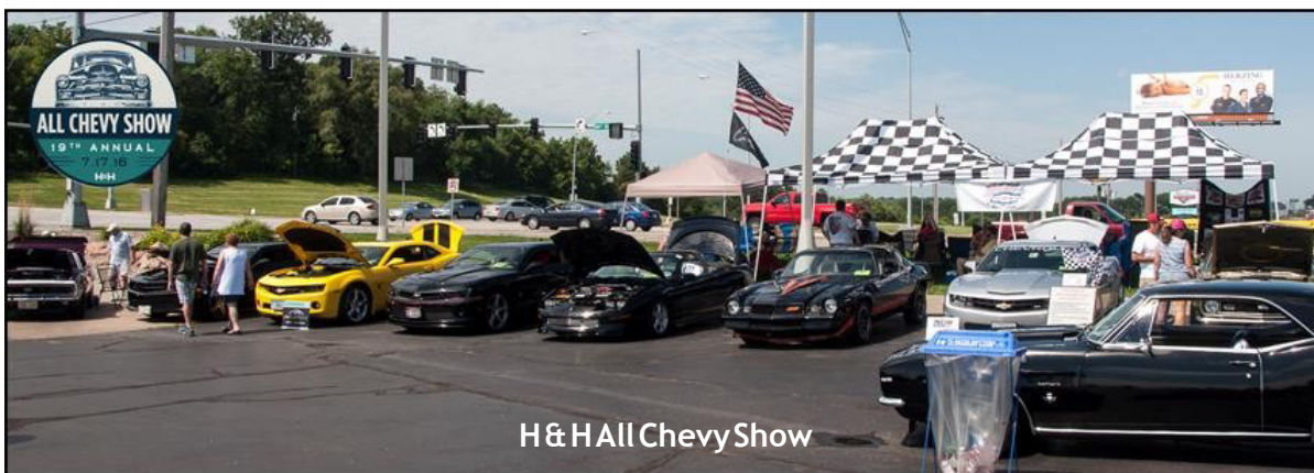
H&H All Chevy Show