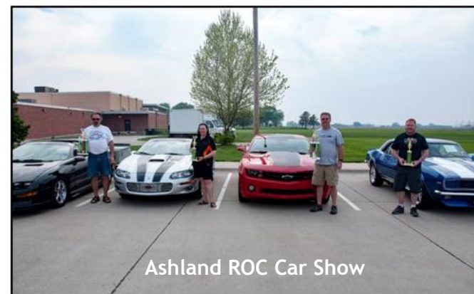
Ashland ROC Car Show