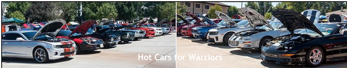
Hot Cars for Warriors