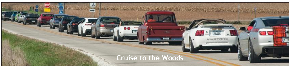
Cruise to the Woods