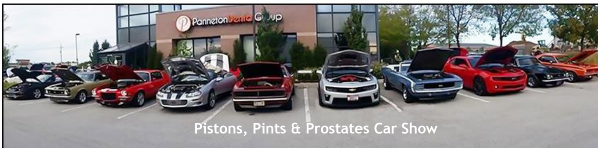
Pistons, Pints & Prostates Car Show